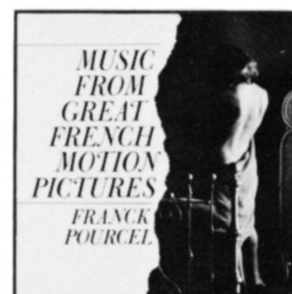
MUSIC FROM GREAT FRENCH MOTION PICTURES • Franck Pourcel and His Orchestra • The Good Life (The 7 Capital Sins); Manha de Carnaval (Black Orpheus); Forbidden Games; Mon Oncle; Rififi; Devil in the Flesh; Stowaway in the Sky; And God Created Woman, more. SP-8603