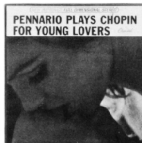
PENNARIO PLAYS CHOPIN FOR YOUNG LOVERS • Favorite compositions in the quiet, romantic mood including several that inspired popular songs — "Heroic" Polonaise; "Raindrop" Prelude; Fantasia impromptu in C sharp minor; Etude in E; Nocturne in E flat; other Waltzes, Preludes. SP-8626