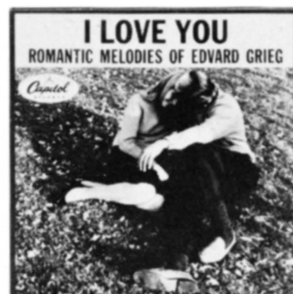
I LOVE YOU • Romantic melodies of Edvard Grieg, featuring Leonard Pennario in the first movement of the Piano Concerto • with the Hollywood Bowl Symphony Orchestra • Ich liebe dich; Erotique; Solveg's Song; Morning; others. SP-8597