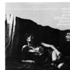
MUSIC FROM GREAT ITALIAN MOTION PICTURES • Pino Calvi and His Orchestra • Themes from La dolce vita; The Leopard; Mondo cane; Divorce—Italian Style; Anna; 8 1/2; Street of Dreams; Four Days in Naples; La Strada; others. SP-8608

THIS MONOPHONIC MICROGROOVE RECORDING IS PLAYABLE ON MONOPHONIC AND STEREO PHONOGRAPHS. IT CANNOT BECOME OBSOLETE. IT WILL CONTINUE TO BE A SOURCE OF OUTSTANDING SOUND REPRODUCTION, PROVIDING THE FINEST MONOPHONIC PERFORMANCE FROM ANY PHONOGRAPH.