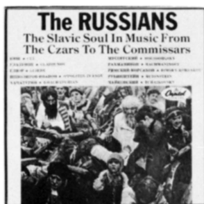
THE RUSSIANS • Orchestral favorites by ten great Russian composers from the Czars to the Commissars — Borodin, Cui, Glière, Ippolitov-Ivanov, Khachaturian, Moussorgsky, Rachmaninoff, Rimsky-Korsakov, Rubinstein and Tchaikovsky • Carmen Dragon, The Capitol Symphony Orchestra. SP-8628

ALSO ON CAPITOL CLASSICS • S indicates Stereo.