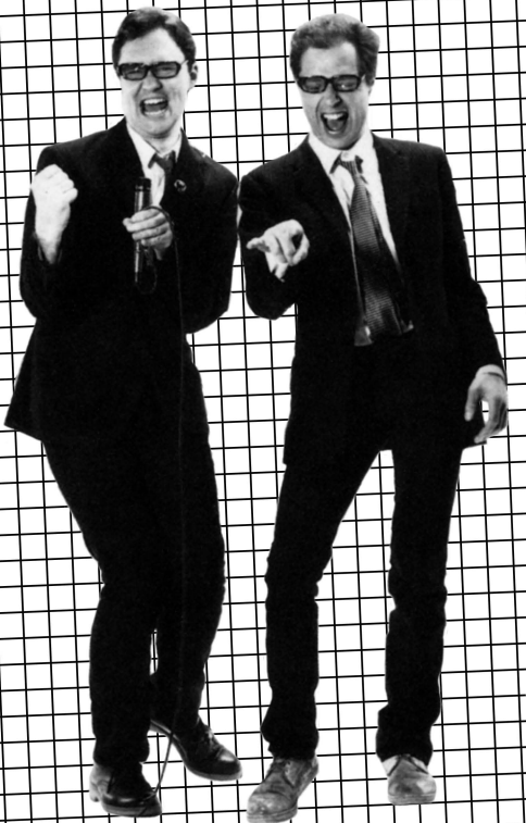
THE OUTER LIMITS - Commercials "And mums... remember this one!"