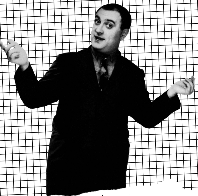
ALEXEI SAYLE - Some Jokes "These two Popes go into a bike shop..."