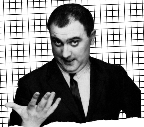
ALEXEI SAYLE - Introduction "Welcome to the Comic Strip Laugh-a-thon..."