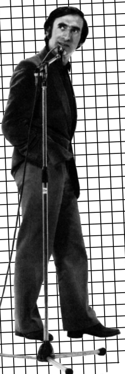
ARNOLD BROWN - Why not? "You remember human beings? We used to be big in the '60s"