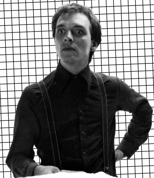
20th CENTURY COYOTE - Rik's poems - First attempt. "Do you want to come up here and do it?"