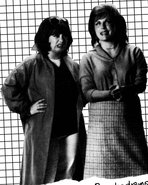
FRENCH & SAUNDERS - Psychodrama "Your husband told me about your clitoral frigidity..."