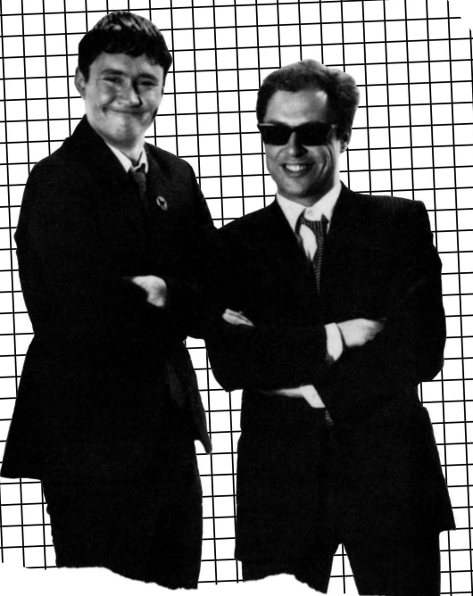
THE OUTER LIMITS - The Cabaret Biz "We're the new owners of this club..."