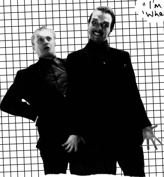
20th CENTURY COYOTE - The Dangerous Brothers "I'll do the talking..."