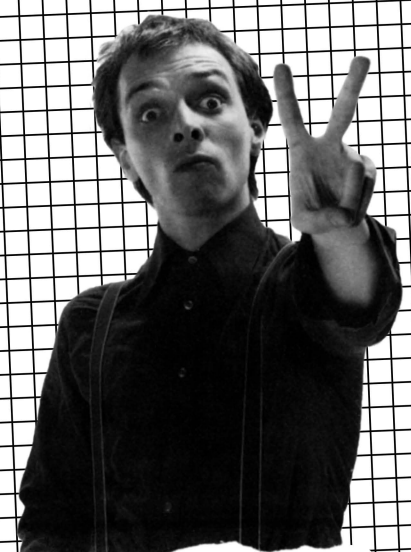
20th CENTURY COYOTE - Rik's poems - Second Attempt "Shut up! ... Hippies!"