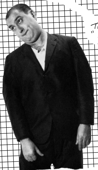
ALEXEI SAYLE - Alternative Childhood "We used to get all these exchange visitors"