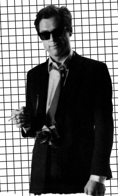
THE OUTER LIMITS - Page 3 Girls "My friends call me Lady Di... ..coz I like working with children"