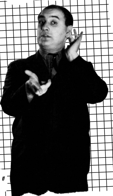
ALEXEI SAYLE - Dayjob "I'm actually the gossip columnist for 'What's On In Stoke Newington'..."