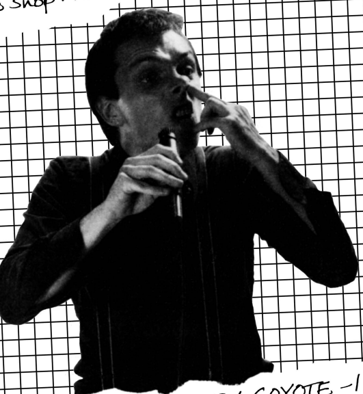
20th CENTURY COYOTE - I'm Evil "If you're looking for trouble... Just look right in my face..."