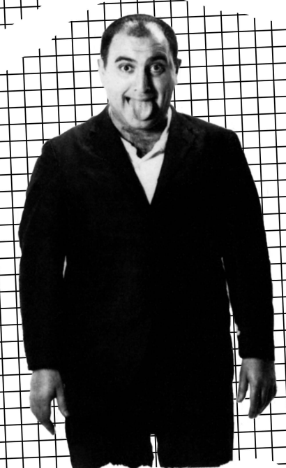
ALEXEI SAYLE - Break "I cried sucking a Fisherman's Friend..."