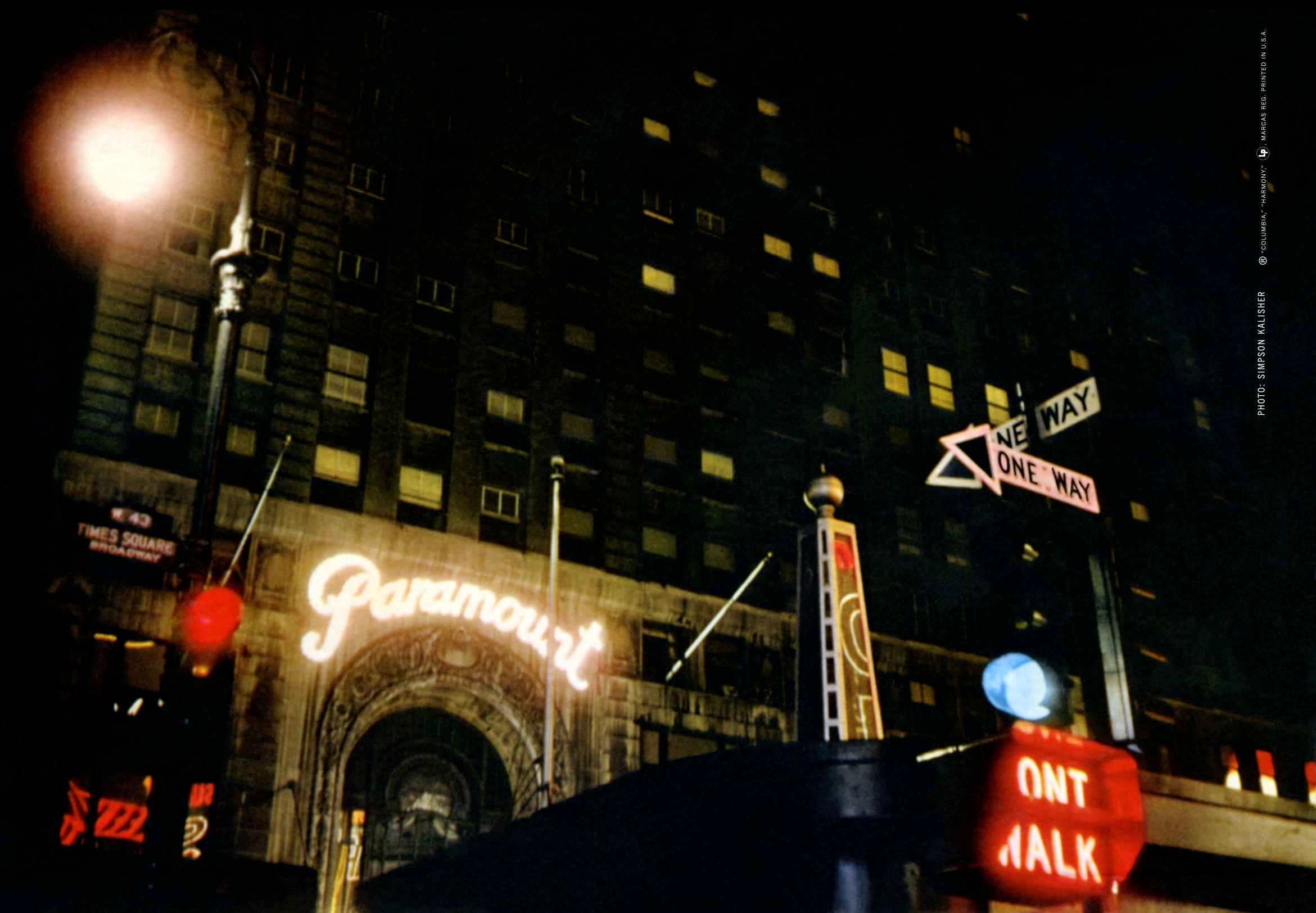
PHOTO: SIMPSON KALISHER © COLUMBIA, "HARMONY," MARCAS REG. PRINTED IN U.S.A.

THE CONTINENTAL / MY DARLING / LOVER, COME BACK TO ME / PLAY GYPSIES, DANCE GYPSIES / CHARMAINE / DIANE / SOFTLY AS IN THE MORNING SUNRISE NIGHT AND DAY / DEEP PURPLE / WHEN YUBA PLAYS THE TUBA / ONE ALONE / BEGIN THE BEGUINE / SLEEPY TIME GAL / CHLOE