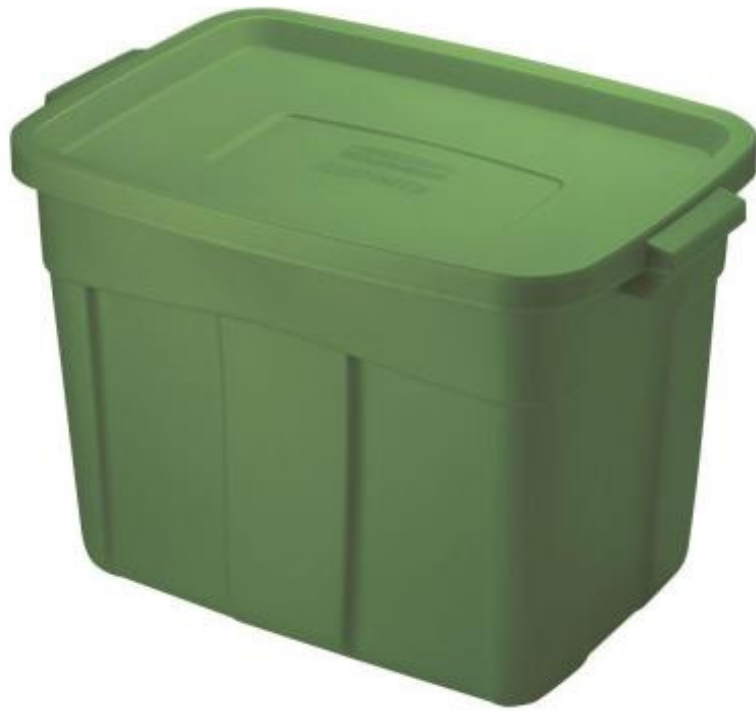
18-gallon tote, green