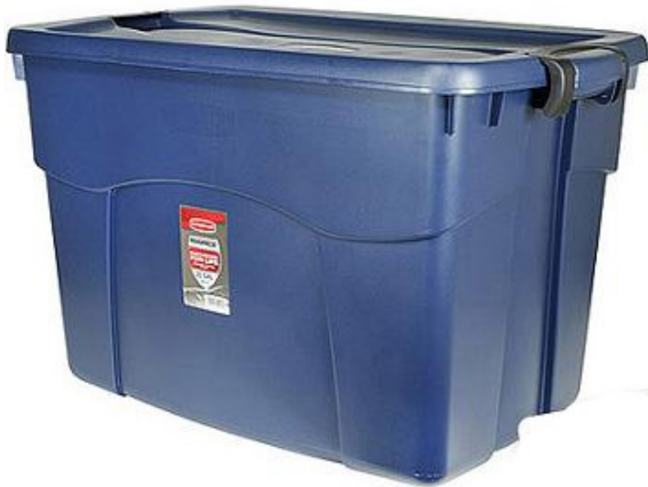
Rubbermaid Roughneck tote, blue, 22-gallon