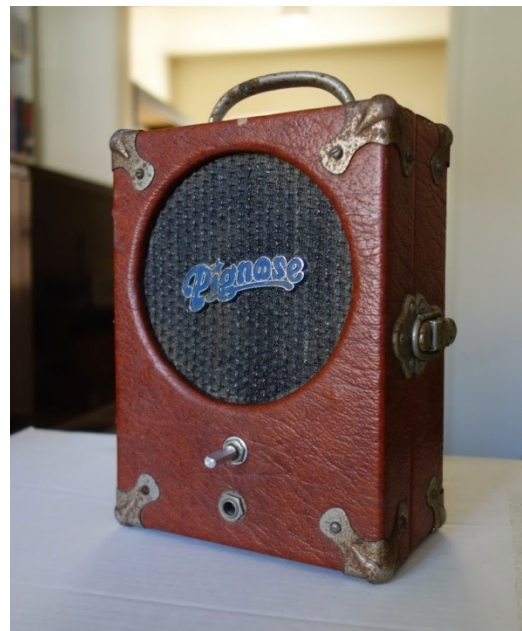
Pignose portable amplifier