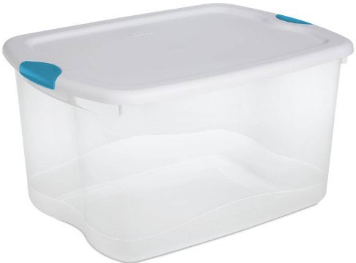
Sterilite clear 70-quart tote with blue handles