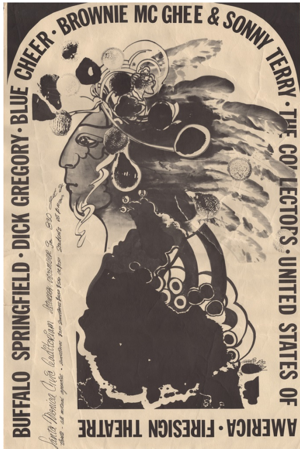
Poster, Buffalo Springfield etc., Santa Monica Civic Auditorium