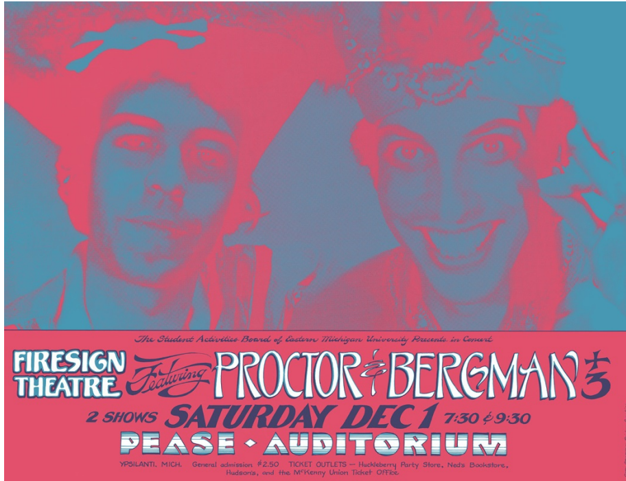
Poster, Proctor and Bergman, Pease Auditorium