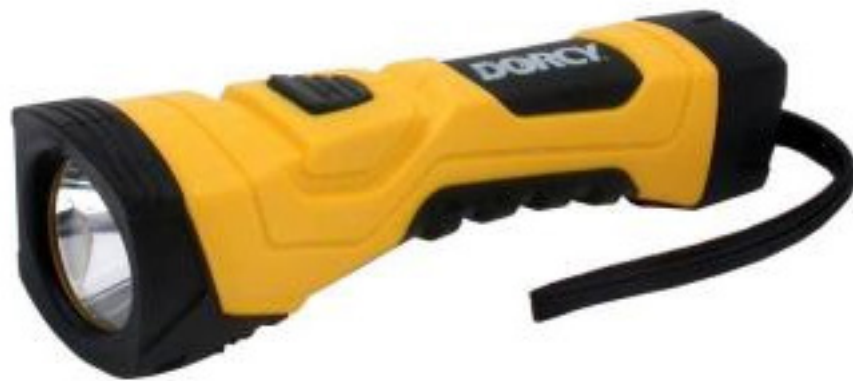
Dorcy LED Flashlight