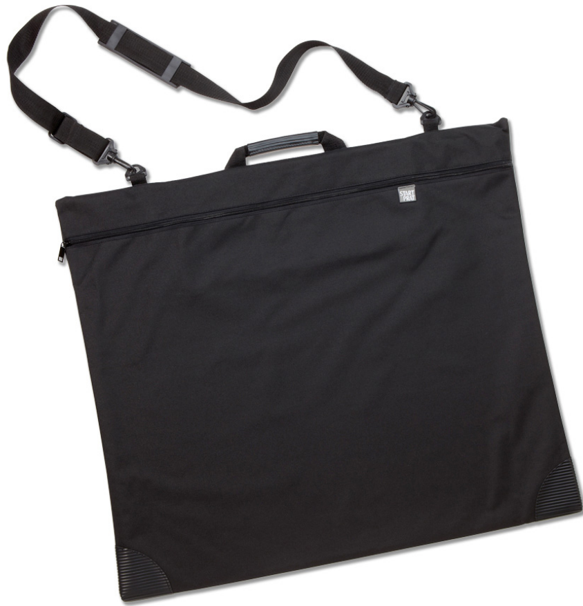
Soft-sided portfolio, black