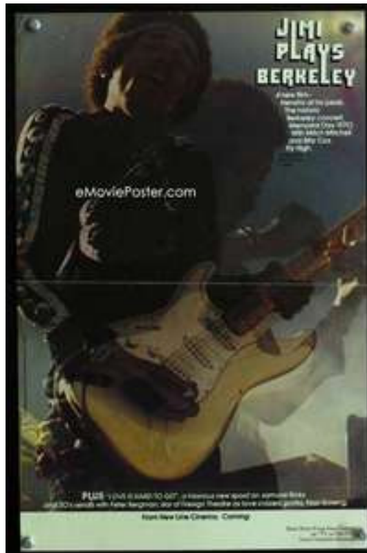
Poster, Jimi Plays Berkeley / Love Is Hard To Get